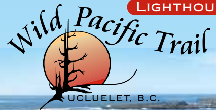
Panoramic views near the lighthouse

2 km 1.5 km 1 km .5 km 2.6 km loop 45-60 minutes + view stops LIGHTHOUSE Amphitrite Barkley Sound