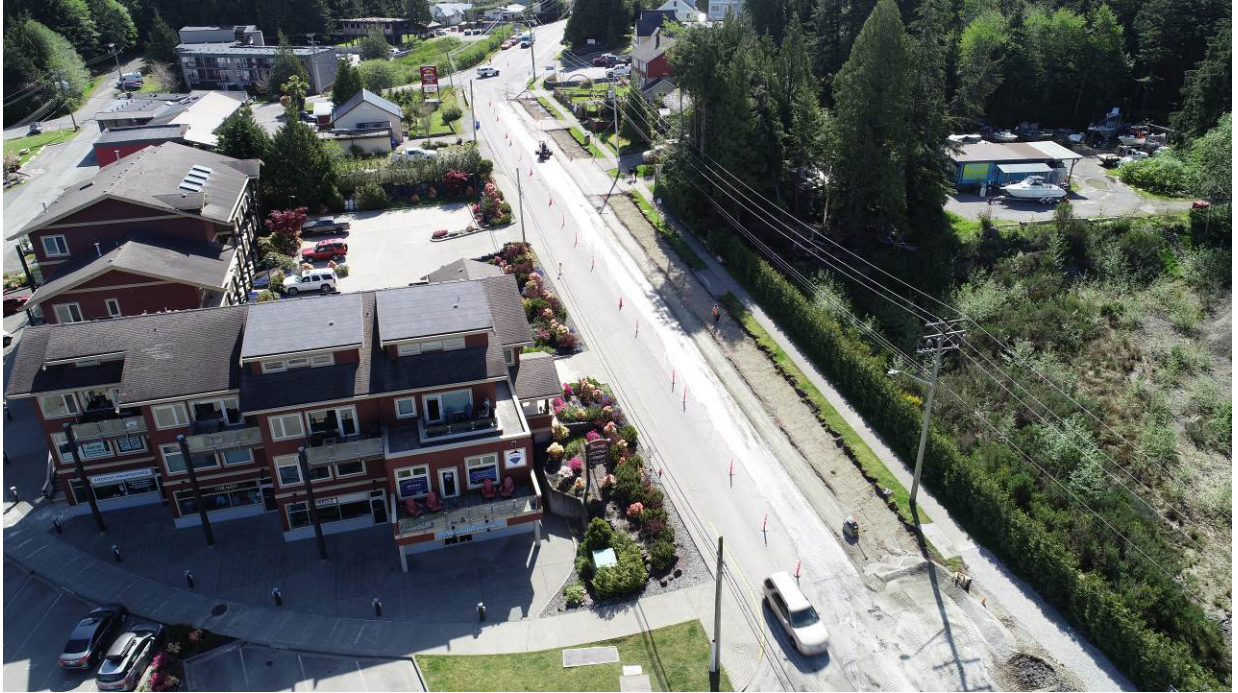
Photo #7 – Curb & Boulevard Preparation (Lyche Rd to Hemlock Rd) – Ongoing