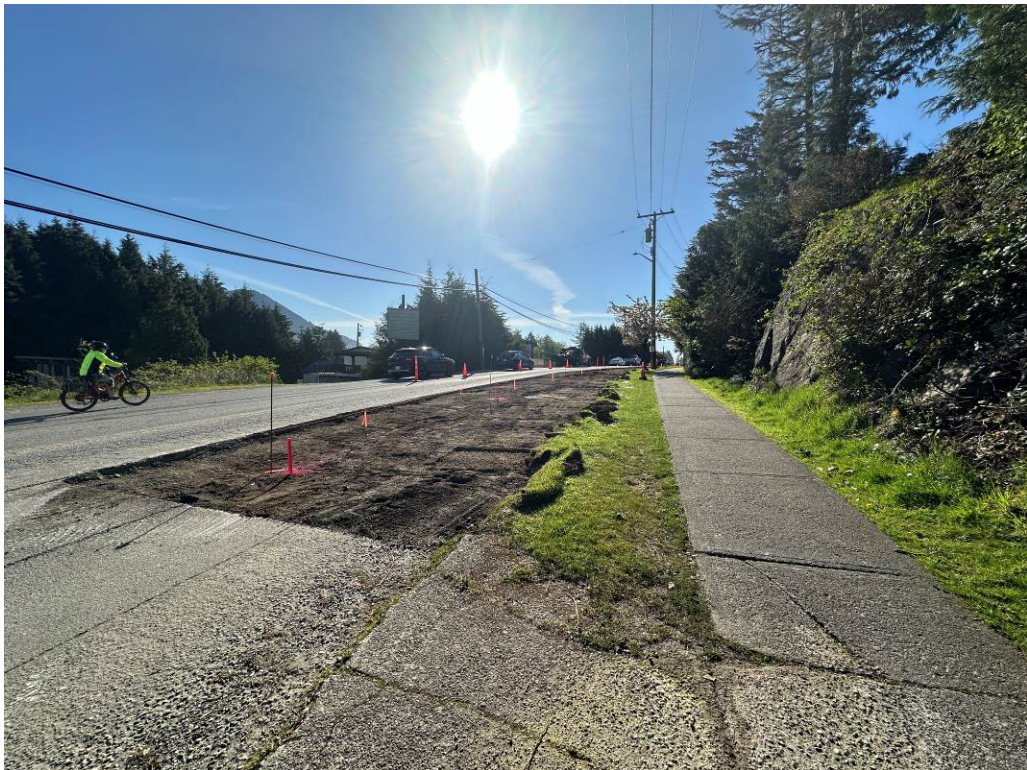
Photo #6 – Curb & Boulevard Preparation (Hemlock Rd to Bay St) – Ongoing