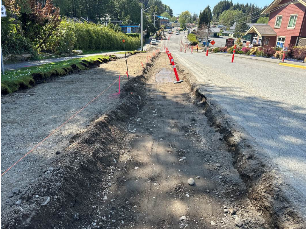
Photo #5 – Curb & Boulevard Preparation (Lyche Rd to Hemlock Rd) – Ongoing