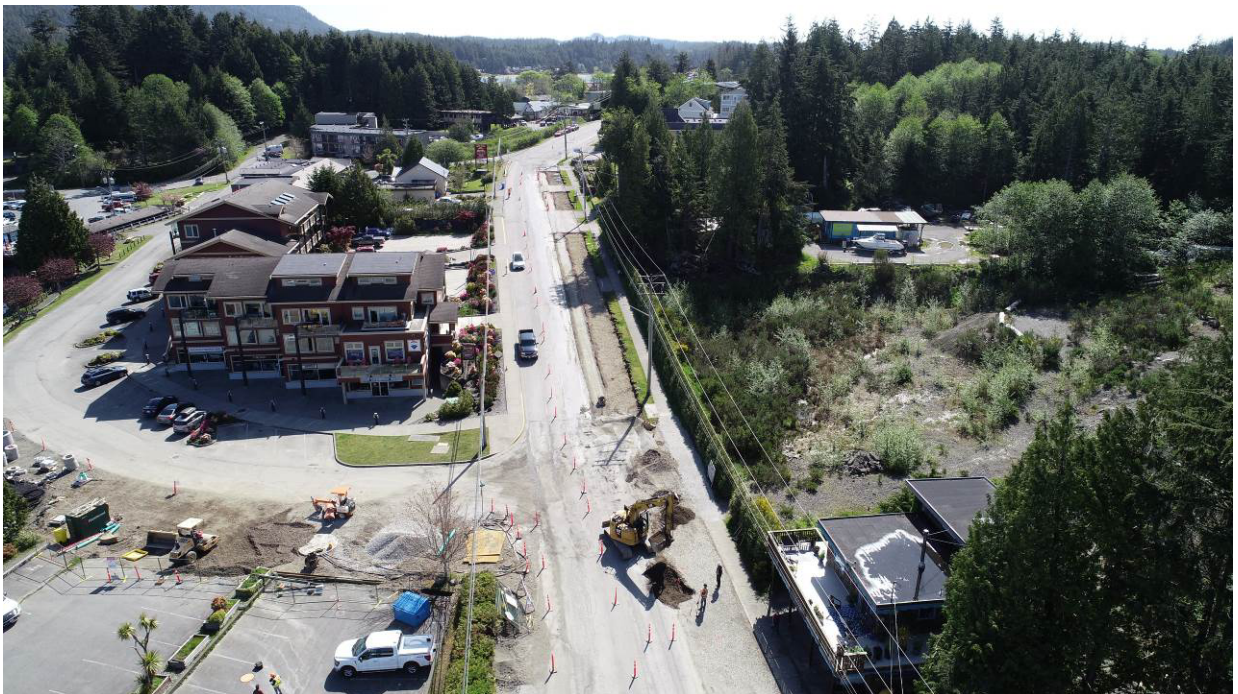
Photo #8 – Curb & Boulevard Preparation (Lyche Rd to Hemlock Rd) – Ongoing